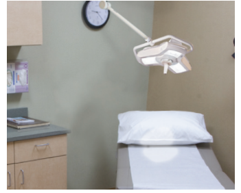
Compact Design 20" (51 cm) diameter lighthead