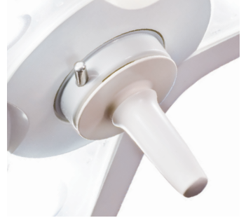
Sterilizable Center Handle Extremely smooth focus mechanism