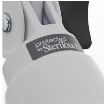
Protected by SteriTouch® antimicrobial powder coating