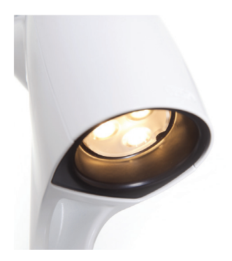
Recessed light source inside light head to reduce glare.