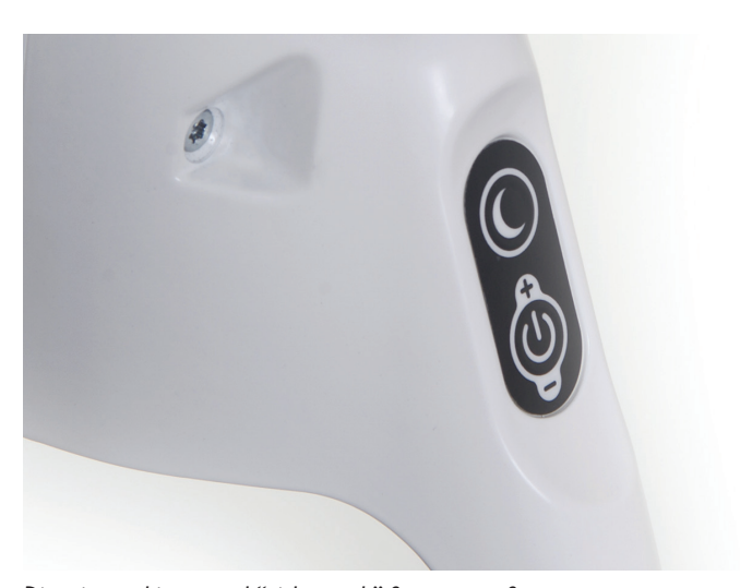
Dimming and integrated "night-watch" for user comfort and convenience.