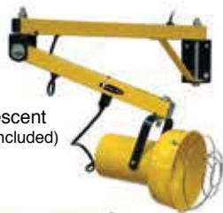
Incandescent (Bulb not included)