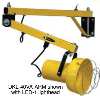
DKL-40VA-ARM shown with LED-1 lighthouse