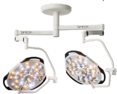
Sim.LED 8000 Operating Lights

Check out our additionally available products: