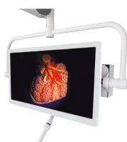
Sim.SCREEN monitor holders