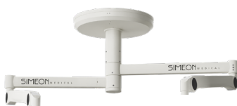
Suspension arm systems