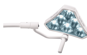
Minor surgery & examination lights