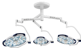
BusinessLine Operating Lights